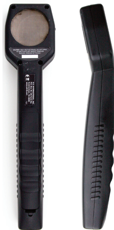
Detector Bottom View