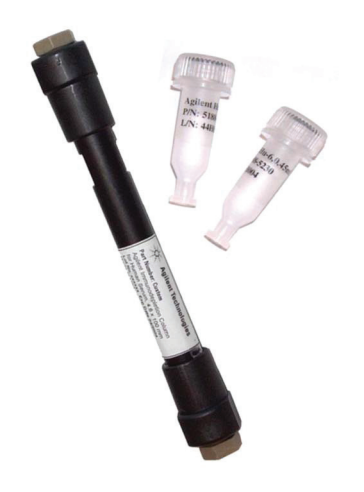
Figure 1. Multiple Affinity Removal column and spin cartridges.