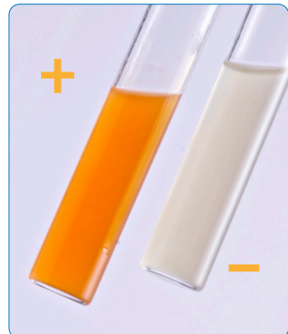
Strep B Carrot Broth™, Cat. no. 76121-436

A rapid sucrose and urea test for the presumptive identification of Corynebacterium jeikeium . 10 tests .....76375-812